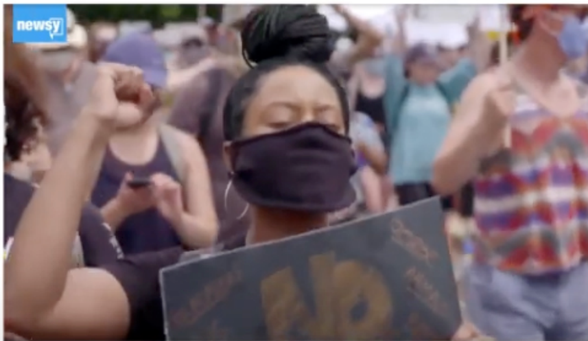
Understanding Racial Trauma

AVAILABLE EXCLUSIVELY IN ACHIEVE STARTING FALL 2022 , this extraordinary new collection features over 120 in-demand clips from high-quality sources—classic and contemporary—as well as engaging original content. It's a remarkably diverse and relevant resource, developed in partnership with a faculty and student advisory board.